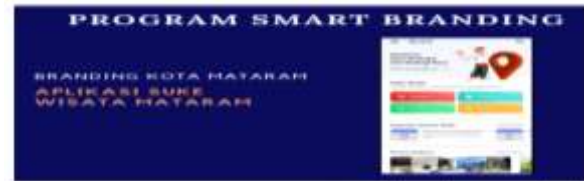
Jurnal Elastisitas FEB Univ.Mataram Maret 2022