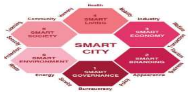
Figure 2. Buku 1 Masterplan Smart City Kota Mataram (2018-2024)