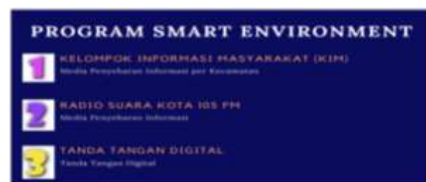
Figure. 14. Mataram City Smart Environment Program

Jurnal Elastisitas FEB Univ.Mataram Maret 2022