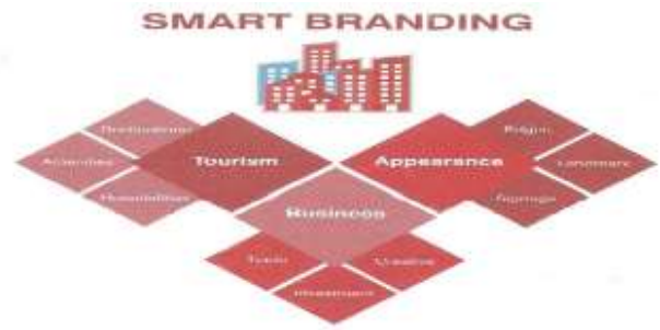
Figure 5. Buku 1 Masterplan Smart City Kota Mataram (2018-2024)

Mataram City Branding, is the "SUKE TOURISM MATARAM" application