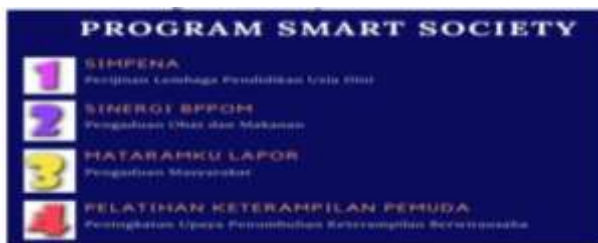
Figure. 12. Mataram City Smart Society Program

Jurnal Elastisitas FEB Univ.Mataram Maret 2022