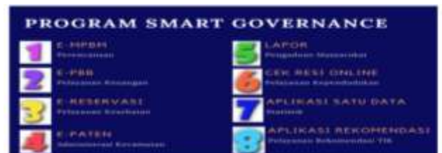
Figure.4. Mataram City Smart Governance Program.

Jurnal Elastisitas FEB Univ.Mataram Maret 2022