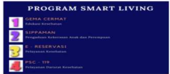
Figure. 10. Mataram City Smart Living Program

Jurnal Elastisitas FEB Univ.Mataram Maret 2022