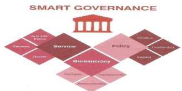
Figure 3. Buku 1 Masterplan Smart City Kota Mataram (2018-2024)