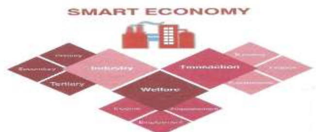
Figure.7. Smart Economy Framework