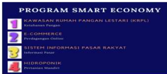
Picture. 8. Smart Economy Program

Jurnal Elastisitas FEB Univ.Mataram Maret 2022