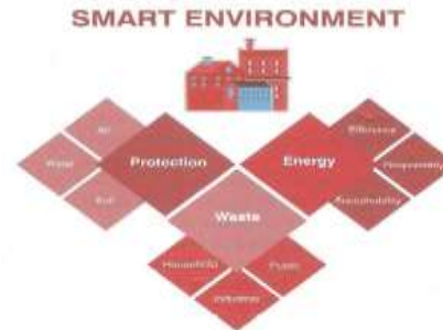
Figure 13. Buku 1 Masterplan Smart City Kota Mataram (2018-2024)