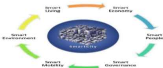
Figure 1. Buku 1 Masterplan Smart City Kota Mataram (2018-2024)

The development of smart cities in priority tourist areas is in accordance with the following six pillars: