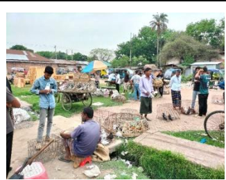
Plate 2. Local pigeons at Natore, Tebaria