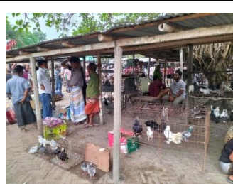
Plate 1. Exotic breeds at Tebaria