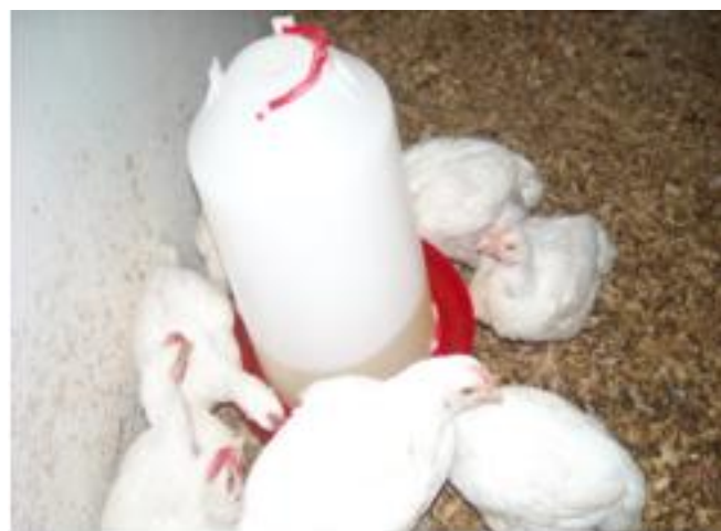
Photo 7. A 10-litre plastic water trough