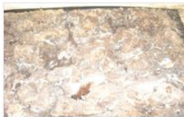
Photo 5. Two months infested peanut meal