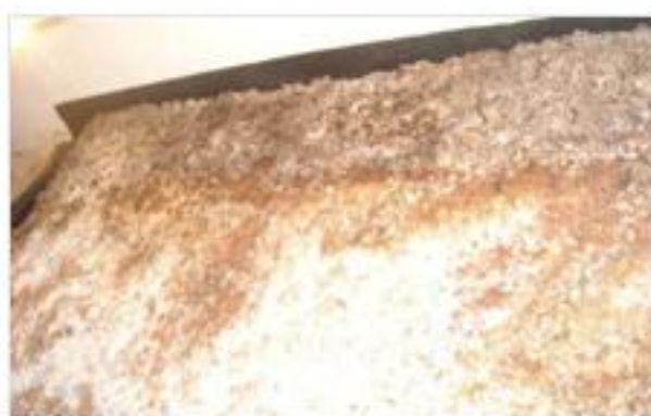
Photo 4. One month infested peanut meal