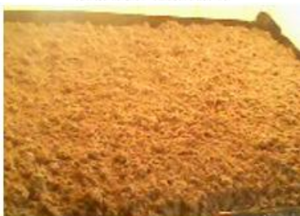
Photo 3. Seller provided peanut meal