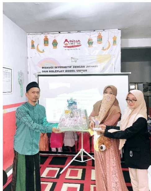
Figure 2. Giving gifts of nebulizers and humidifiers to orphanages

The use of aids such as nebulizers and humidifiers can help overcome the symptoms of ARI. Nebulizers convert liquid medicine into a fine mist to be inhaled directly into the lungs, while humidifiers add moisture to the air to prevent irritation of the respiratory tract. The use of halal natural ingredients in both of these devices can provide additional benefits in the management of ARI.