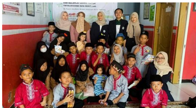
Figure 3. The documentation after the event

Community service with the theme "Interactive Discussion with Jigsaw and Roleplay Models for the Management of Recurrent Acute Respiratory Infections at the Mizan Amanah Orphanage" needs to be carried out to increase children's knowledge and understanding of recurrent ARI, improve clean and healthy living behavior, increase related insight halal nutrition and thoyyib to prevent recurrent ARI and increase access to health services. It is hoped that this community service can help reduce the incidence of recurrent ARI in children at the Mizan Amanah orphanage.