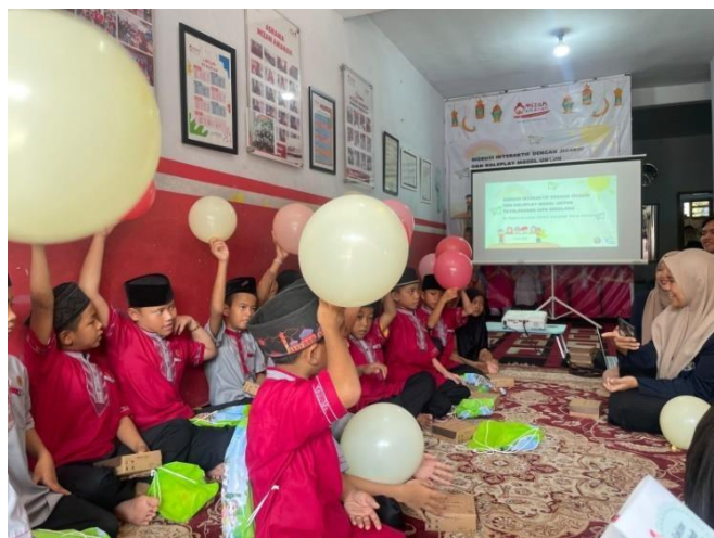
Figure 1. Participants enthusiastically answered questions by lifting balloons

From the data in table 5, it was found that the increase in participants' knowledge before and after the test was calculated from the number of participants who answered correctly by lifting the balloons provided by the committee. The mean obtained before the intervention was 77.8% and after the intervention was 86.6%.