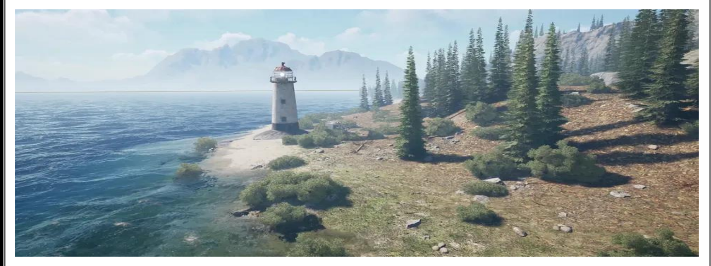
Figure 2. Lighthouse. Cydever. (CC-0)

These innovations in AI tools mark the dawn of a new era in game design, where interactive, real-time content generation is no longer limited to developers. Players now have the power to influence game environments, narratives, and challenges, leading to a future where games evolve continuously based on player agency. For