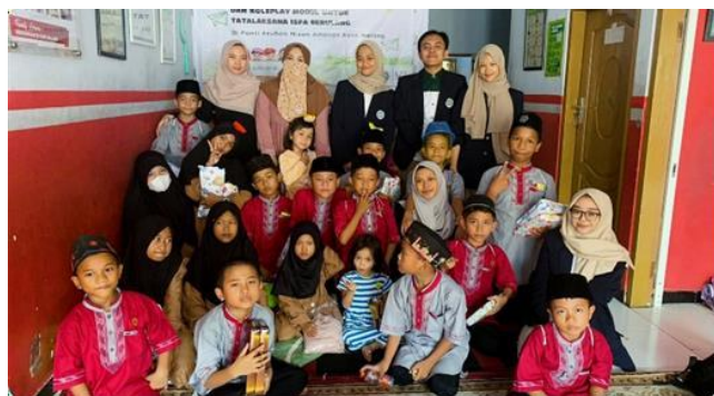
Figure 3. The documentation after the event

Community service with the theme "Interactive Discussion with Jigsaw and Roleplay Models for the Management of Recurrent Acute Respiratory Infections at the Mizan Amanah Orphanage" needs to be carried out to increase children's knowledge and understanding of recurrent ARI, improve clean and healthy living behavior, increase related insight halal nutrition and thoyyib to prevent recurrent ARI and increase access to health services. It is hoped that this community service can help reduce the incidence of recurrent ARI in children at the Mizan Amanah orphanage.